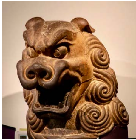
Chinese Lion Head, 1000-1127, Iron.

Lunch on your own at one of DIA's restaurants.