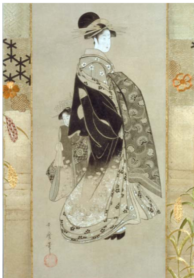
Courtesan in Procession , Kitagawa Utamaro, 1793–1795, ink, white pigment, and red color on paper.

Morning, our private tour of University of Michigan Museum of Art Asian collection led by curator of Asian Art. UMMA is noted for its Japanese painting collection which will be the focus of our tour. The museum is home to the largest collection of Asian art in the state of Michigan.