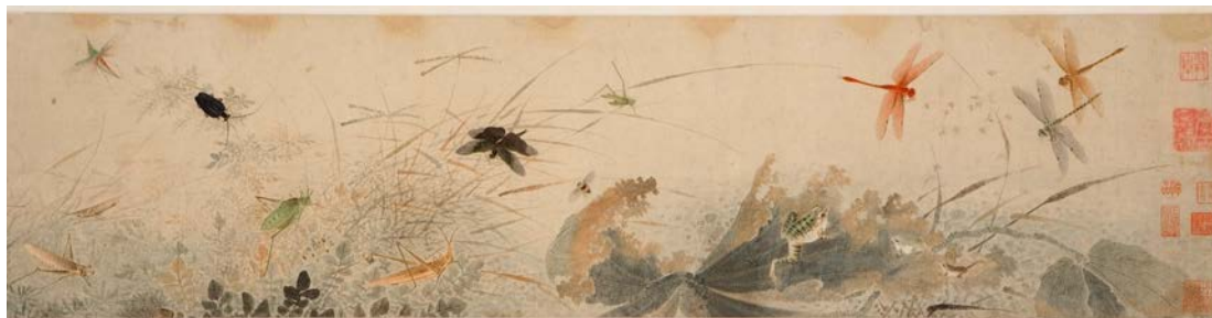
“Early Autumn,” signed Qian Xuan, late 1200s–1300s, Ink and watercolor on paper.

Morning, private tour of eight newly expanded galleries in the Robert and Katherine Jacobs Asian Wing led by DIA's Associate Curator of Arts of Asia and the Islamic World. Works span thousands of years up to the present day in galleries of Japanese, Chinese, Korean, and Indian and Southeast Asian art, as well as a gallery for Buddhist art across Asia.